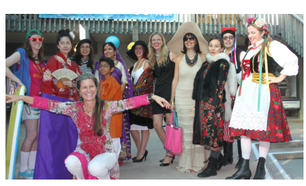
International Fashion Show, 2014

International Fashion Show Friday, Nov. 20, 2015 during Friday Café